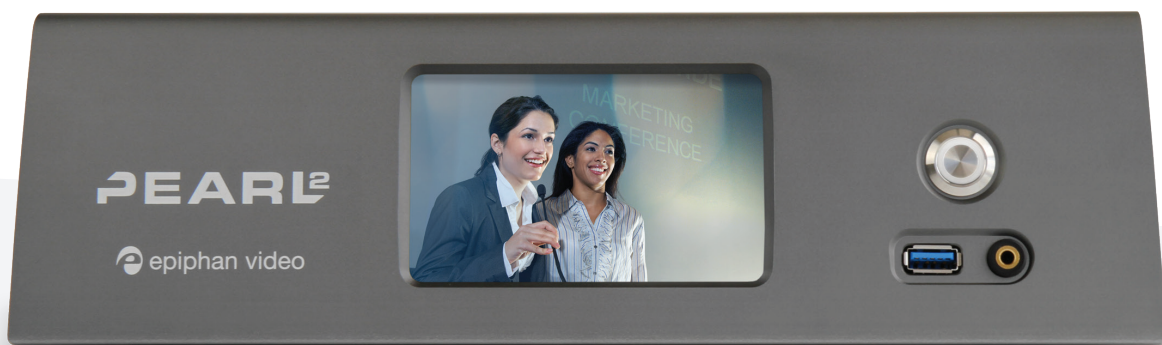
Pearl-2, desktop version For portable live production

Visit epiphan.com/pearl-2 for more information.